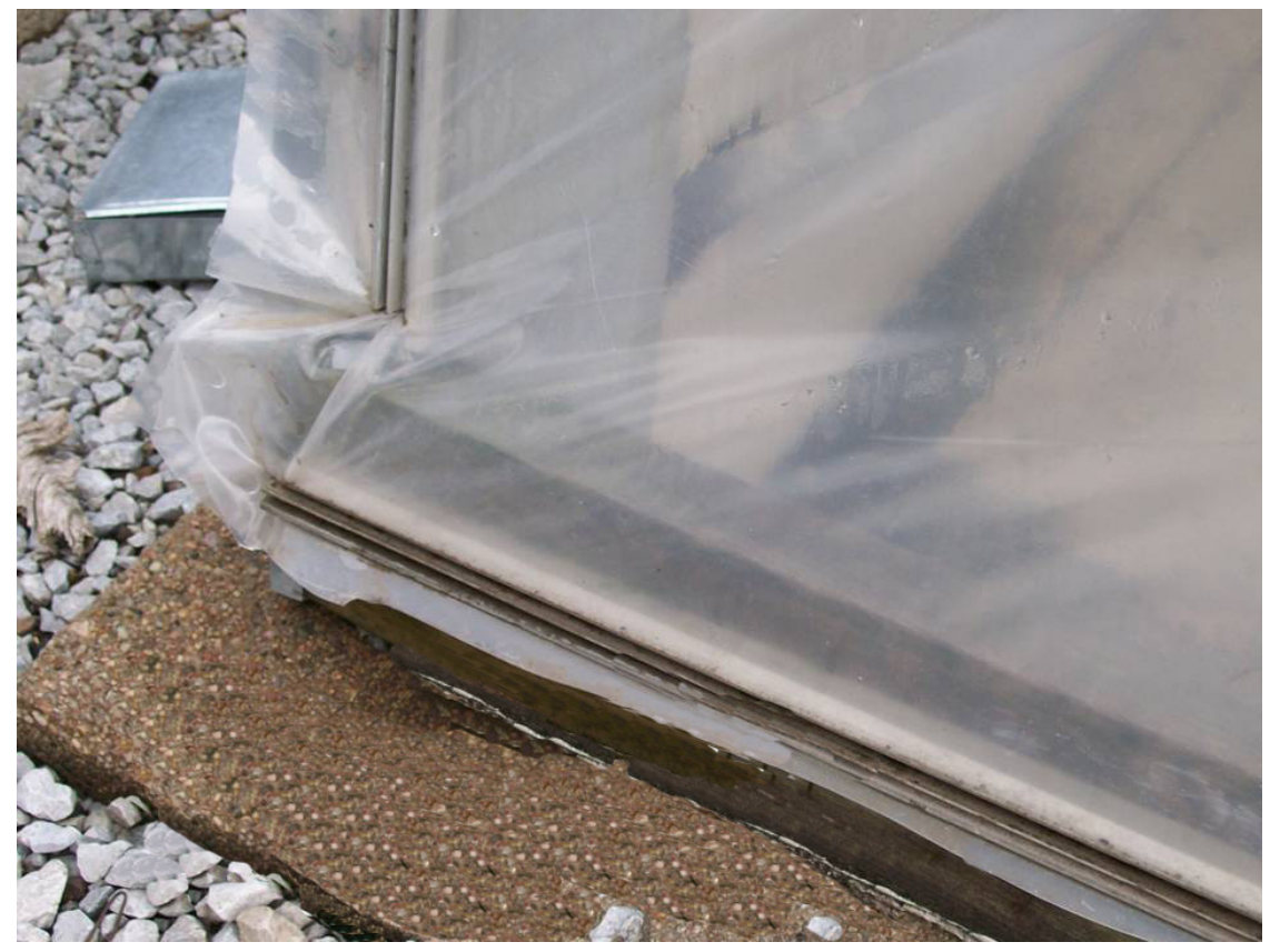
Figure 2. Close-up of solid cement footing into which structural posts are set. A 2-by-6-inch board is affixed to the posts, and polylock is attached to the board.