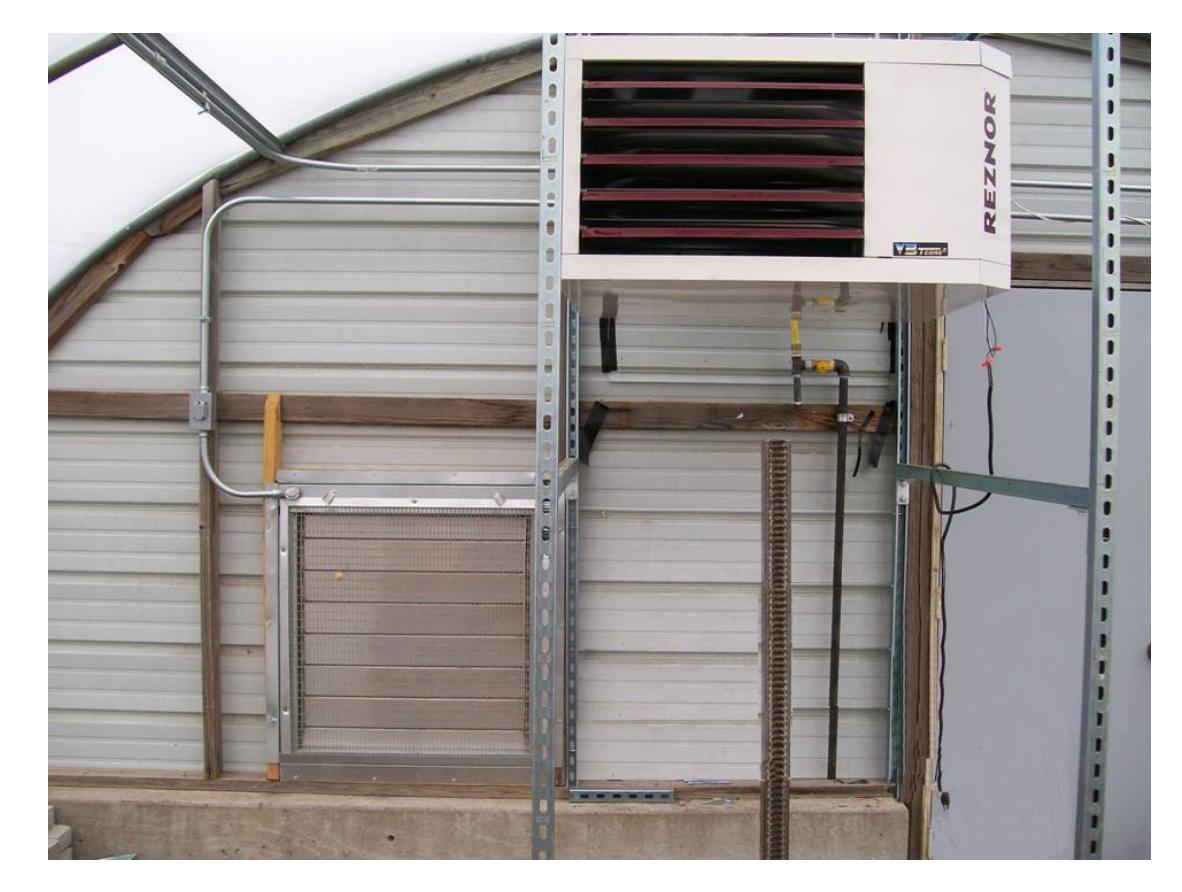
Figure 4. Interior of greenhouse north wall with exhaust fan (lower left) and furnace (upper right).

Figure 3. Small squirrel cage fan (A) taking outside air in (B) and blowing it between the layers of polyethylene.