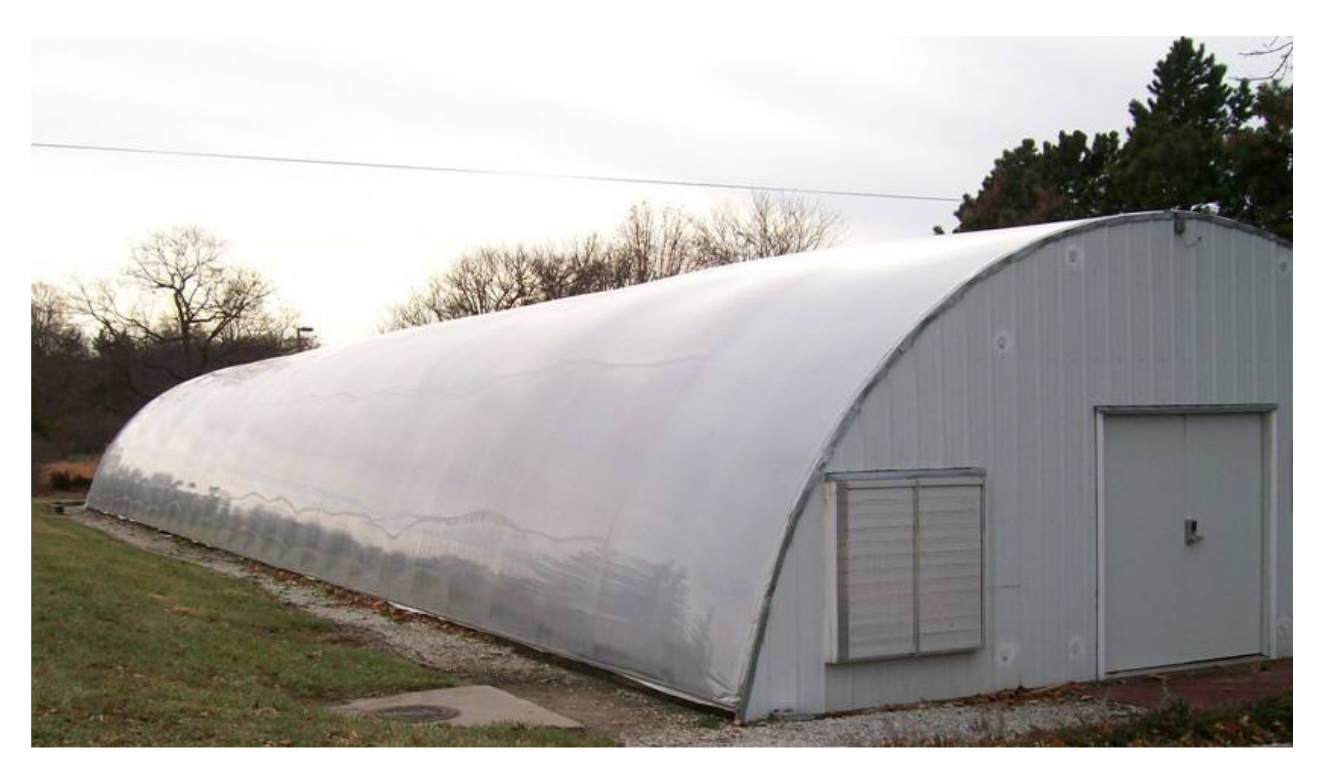
Figure 1. Double poly Quonset-style greenhouse with solid north end wall.