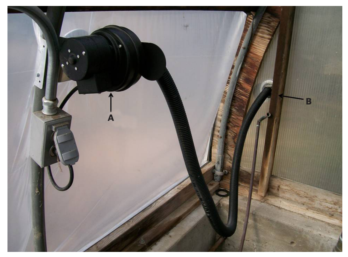
Figure 3. Small squirrel cage fan (A) taking outside air in (B) and blowing it between the layers of polyethylene.